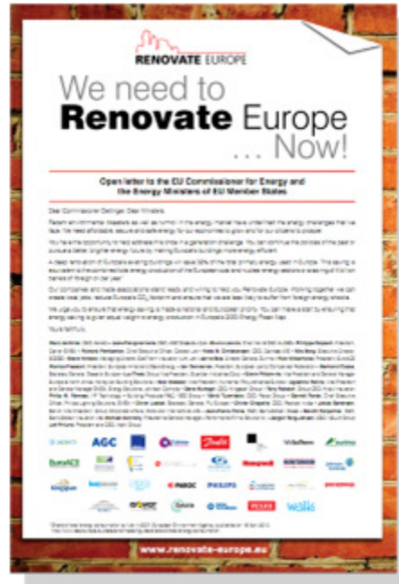
THE CALL TO ACTION

The letter, published simultaneously in Le Monde (France), the Financial Times (UK), the Handelsblatt (Germany), Berlingske (Denmark), and the European Voice (Brussels) and signed by business leaders of Renovate Europe supporters and members, called upon European energy ministers to place energy efficiency in buildings at the heart of the European Union's 2050 roadmap for energy.